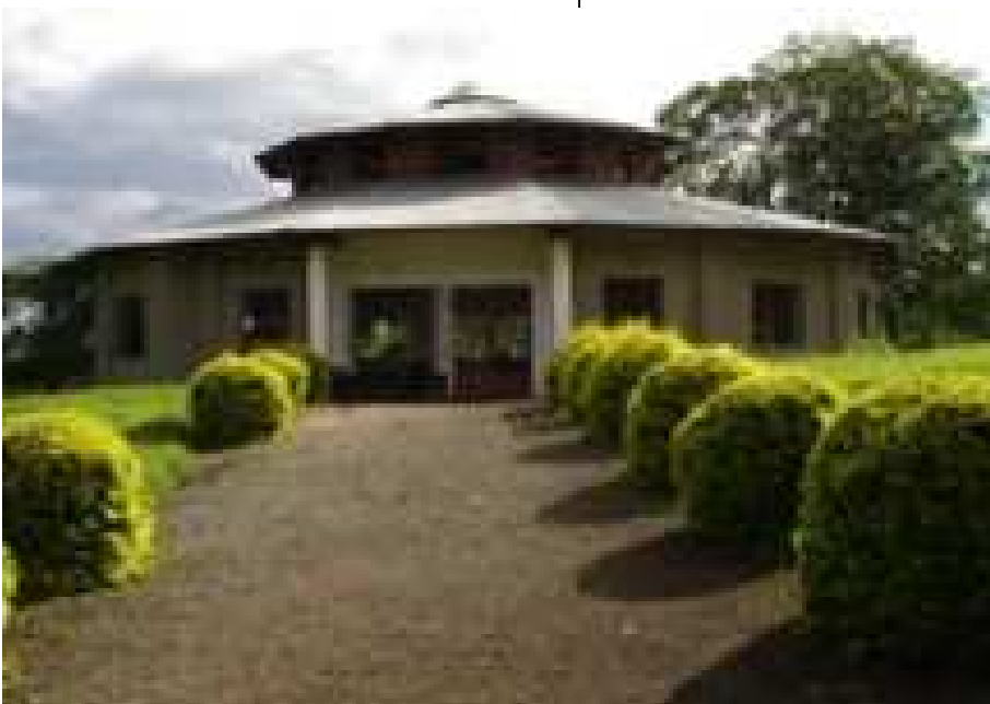
Above: Imbaseni Conference Hall, started 10 years ago and now to have a tiled floor.

The Trust recently made a grant of £2,500 to the Imbaseni SU centre to tile the floor of the conference hall. First started ten years ago, and a magnificent structure to behold, it desperately needed a good floor to enable it to be washed and kept looking clean and tidy – impossible with the present rough concrete floor.